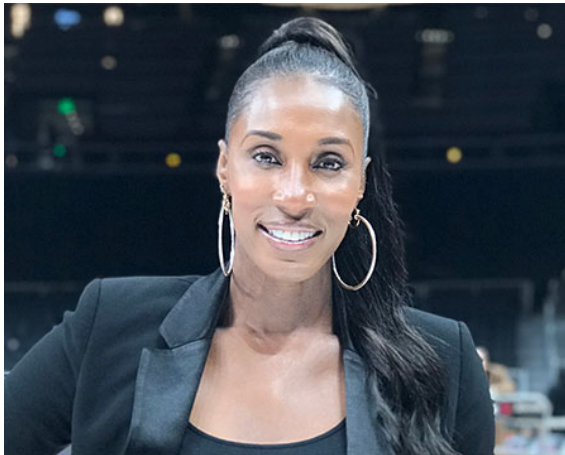
Lisa Leslie, former WNBA player and Olympic Gold Medalist, will be the keynote speaker at the Keeper of the Dream Awards Celebration on January 20.

Before becoming the most-recognized player in the WNBA, Leslie attended Morningside High School in Inglewood, California, where she led the team to two state titles. In college at the University of Southern California, she was the all-time Pac-10 leader in points, rebounds, and blocked shots.