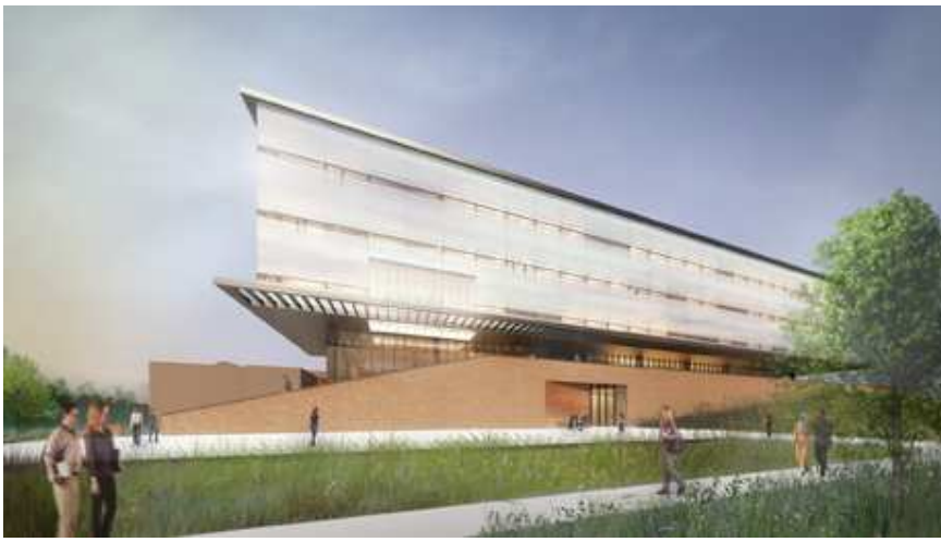
Artistic rendering of the future Engineering Center.