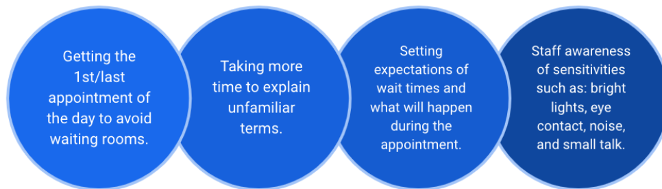
Figure 4: Example accommodations suggested by adult participants with ASD.

All adults with ASD and parents/caregivers, stated that offices make no specific accommodations for ASD patients, but that there were specific accommodations that they would request or have implemented themselves (Figure 4). There are general forms filled out about health history during office visits, but no ASD specific forms or questionnaires were made available to any of the participants. Additionally, only 2 adult patients with ASD said they would fill out ASD-specific forms if available. The parent participant stated that if forms were an option, she would ask her adult with ASD if it was ok to fill them out.