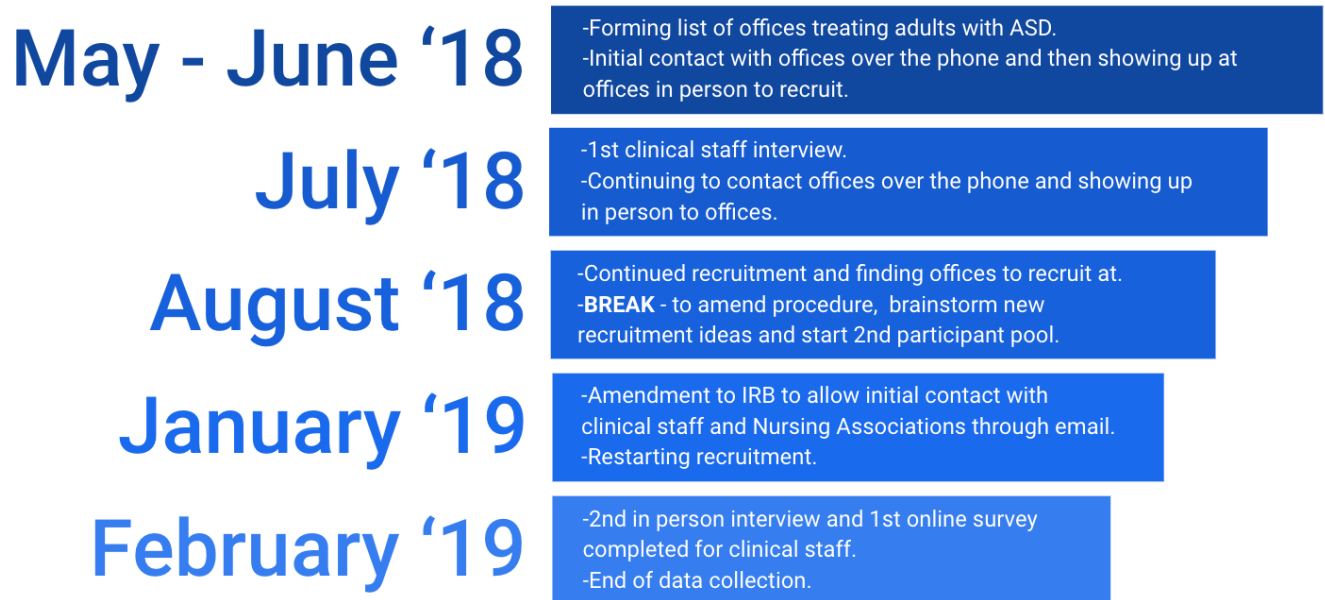
Figure 1: The timeline of recruitment and interviews of clinical staff, including pauses in data collection from May 2018-February 2019.

Interviews of clinical staff were conducted in-person based on participant's availability, at their place of work. If a convenient time could not be identified, phone interviews were suggested or a paper copy of the questionnaire (shown in Appendix 1) in a self-addressed stamped envelope was dropped off at the office. Paper surveys were to be filled out by the participant and returned to the study researchers by mail. If participation was still not achieved from these office staff, then a link to a Qualtrics online survey was made available for completion.