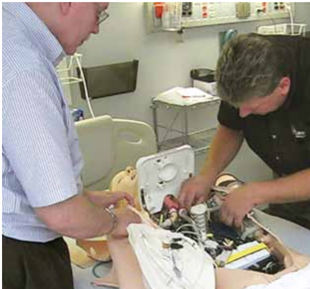
The SON Riverview facility offers students the opportunity to practice skills in a high-tech, high-touch simulation lab.

"OU offers the education, but students also need assistance to break down barriers to learning," says Jaime Sinutko,