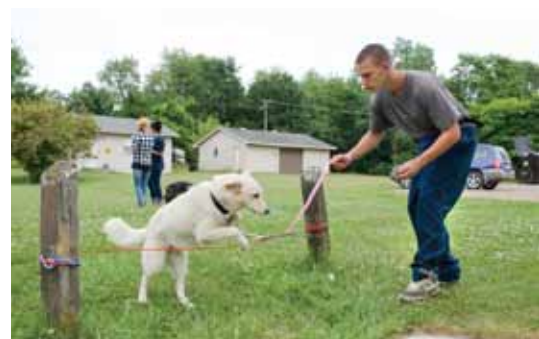
Teacher’s Pet, an Animal-Assisted Therapy program, teaches at-risk youth accountability and responsibility while fostering empathy and compassion.