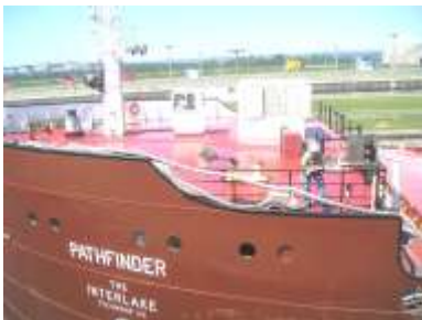
Boat in Soo Locks