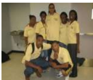
PUB Mentors and staff

PUB's 17 active Senior Seminar participants focused on finding realistic options for "good fit" colleges, identifying financial resources to pay for their education, and developing their electronic profiles for admission advisers to view. Their summer project consisted of individually developing, and presenting to parents and administrators, a PowerPoint presentation of their research findings and conclusions as related to their college matches.