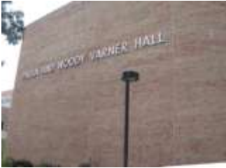
Varner Hall where the event was held

formed a Gospel Choir that performed a series of inspirational praise and worship songs. Uplifting messages were given