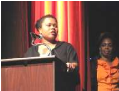
Director of New Bethel Youth Choir

A theme that seemed to emerge from the event was the Biblical illustration of fruit of the vine.