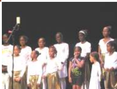
New Bethel Youth Choir

Comparisons were made to how Project Upward Bound is investing in the lives of students (represented as the fruit), and soon that fruit will be