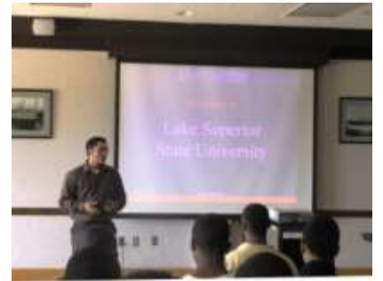
Lake Superior State University