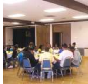
Lake Superior State University