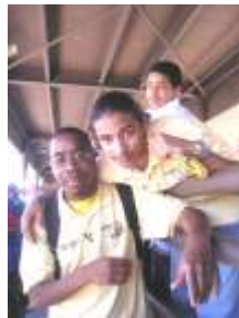
PUB peer mentors and student