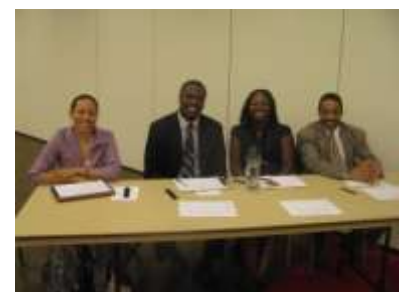
Fashion show judges