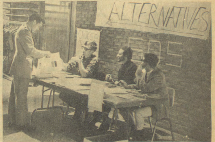
Naval Aviation representative examines conscientious objection literature that greeted his recruiting campaign last week.

This form is used by Atkinson's staff in corresponding with the draft board, and no record is kept of its contents. Thus it is assured that there be no accidental or non-student-authorized correspondence. But a student must fill out the form again when it comes time for renewing the deferment.