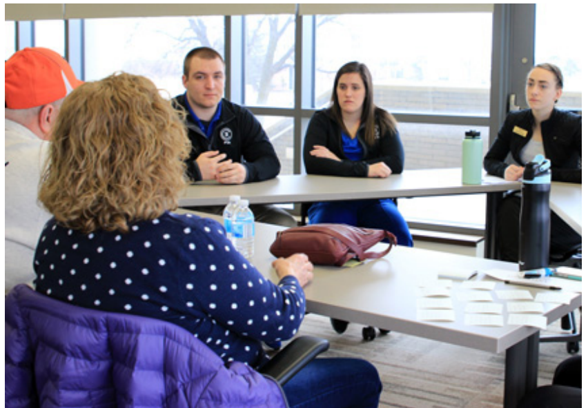
The intra-professional workshop featured 34 Doctor of Physical Therapy students and one Occupational Therapy student from OU, and 24 Physical Therapist Assistant students from Baker College of Auburn Hills.

"These students are in their first semester of our PTA program, so they're learning about concepts right now," she said. "To be able to come here and see someone with real impairments share their experience is very valuable for them."