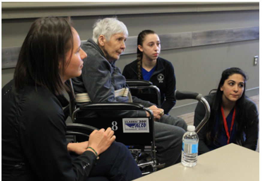
All of the patients at the intra-professional workshop are also participants in OU's Bridge the Gap program, which pairs second- and third-year Doctor of Physical Therapy students with patients who have suffered neurological impairments.