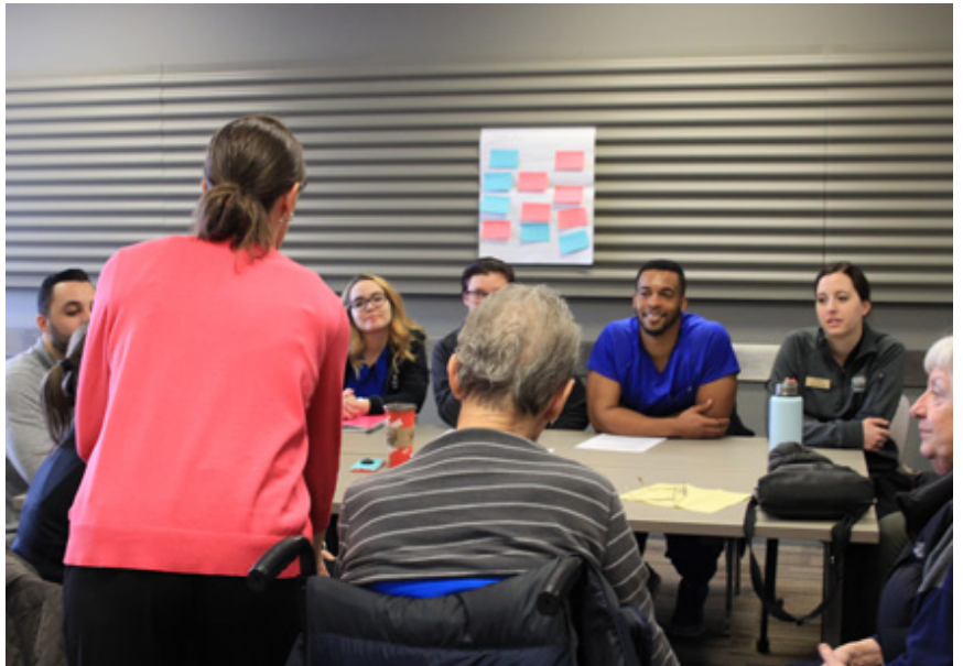
Seven patients and their spouses visited Oakland University to share their experiences dealing with the life-altering effects of stroke.