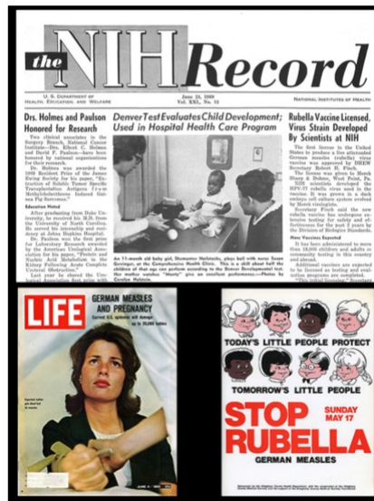
Lower Right: "Today's Little People Protect Tomorrow's Little People," Rubella vaccination day, Allegheny County, Pennsylvania, May 17, 1970.