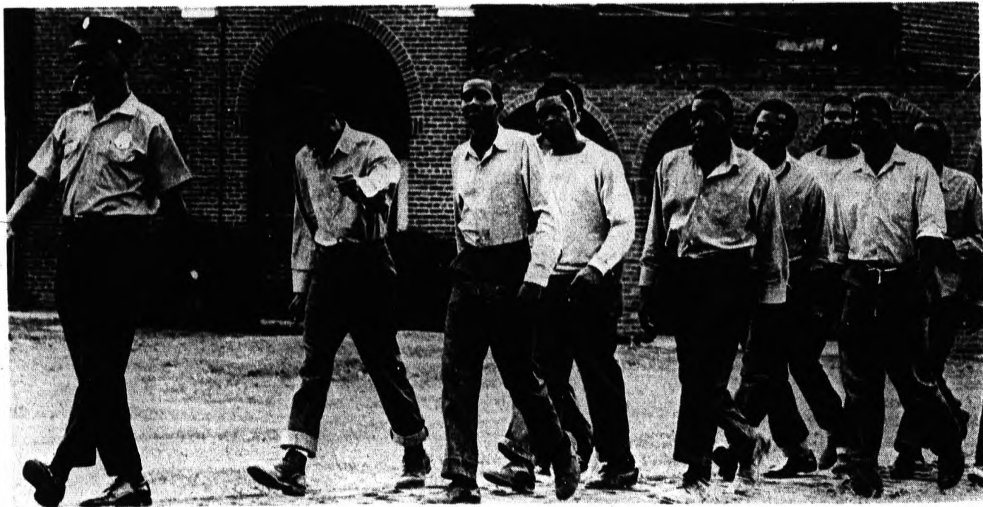
America's jails and prisons will be scrutinized in a report which includes comments by noted psychiatrist Dr. Karl Menninger on "First Tuesday" at 9 p.m. on Channel 4. Here a group of prisoners in an Eastern prison enters a yard for a recreation period.