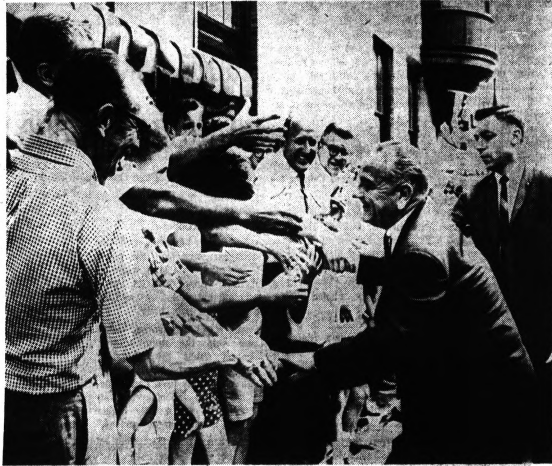
MANY WELCOMES — President Johnson has his right hand and arm gripped by many hands while walking down the main street in Dallas, Texas, on his arrival to help celebrate the town's centennial over the weekend. The President leans over from the enthusiastic grips of the town's citizens.

A U.S. twin-engine Army Caribou transport plane crashed into a Vietnamese village yesterday shortly after taking off from Dong Tra airfield about 250 miles northeast of Saigon.