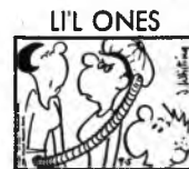
"Hey, Mom, is this what you mean when you say Mrs. Slater is a hot head?"

The lowest temperature reading in Pontiac before 8 a.m. today was 55. It was 60 by 10 a.m.