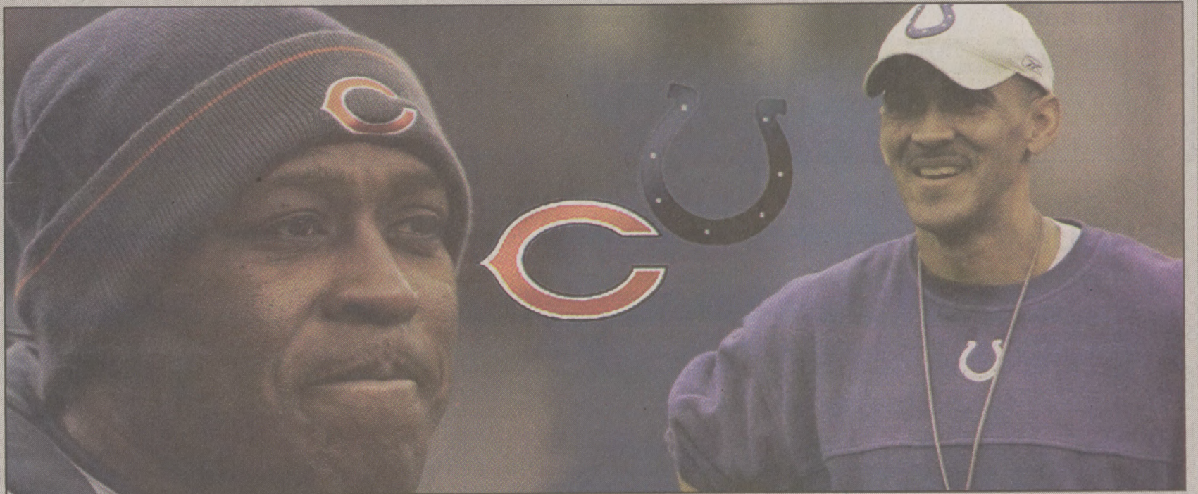
AP Photos/Photo Illustration by Kevin Alford