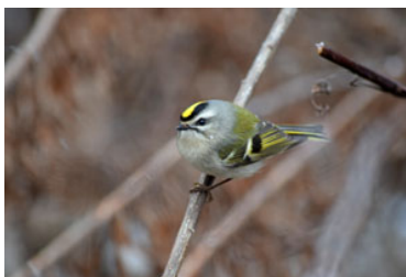
Golden-crowned Kinglet at OU's bio preserve

"The highest intensities for bird migration are typically in the spring and fall – from late April until early June and then again in September," said Mancuso, a master's student in the Department of Chemistry. "I've noticed that at Oakland, the spring migration tends to be particularly eventful."