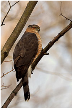
Cooper's Hawk at OU's bio preserve

American Goldfinch, Eastern Bluebird and Red-tailed Hawk, to name a few. He records his observations on ebird.org , a crowdsourced database of bird sightings worldwide. Run by the Cornell Lab of Ornithology, the site provides population distributions for all species in the database, which aids scientific research and conservation efforts.