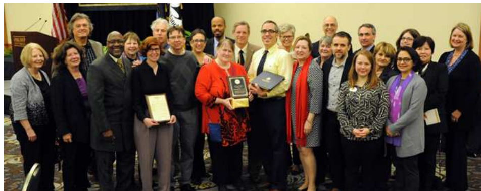
FOUNDER'S DAY - PHOTO BY GEORGE PREISINGER