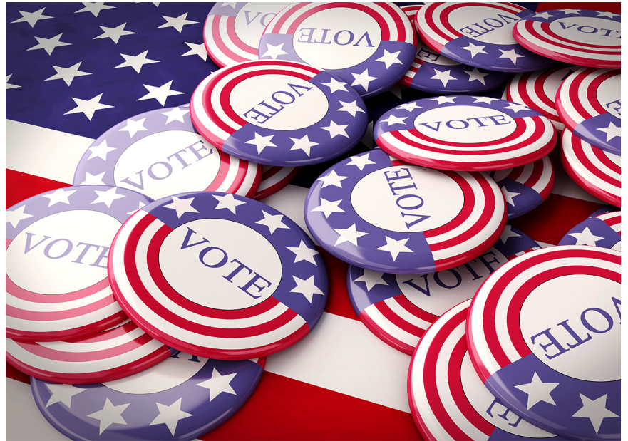
Oakland University is offering a new course that will help students gain a better understanding of the basics of campaign strategy.