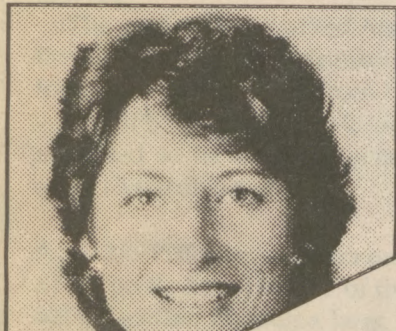
The Snyder File