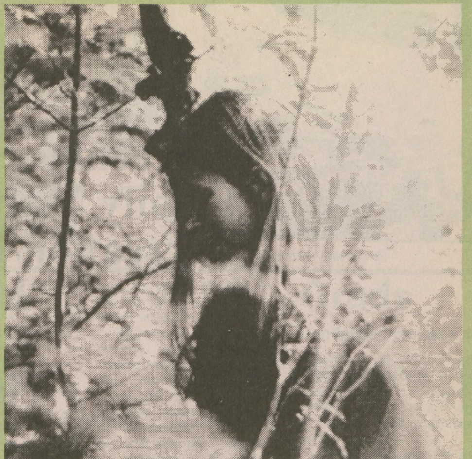
Charlotte Abejean spends a lot of time in the woods on weekends searching for mushrooms that she plans on eating for dinner.