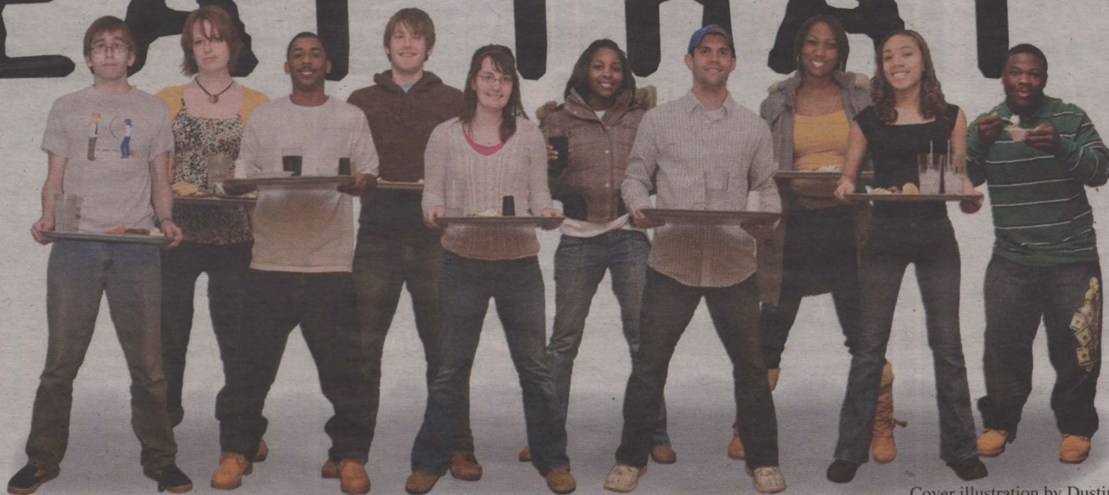
Cover illustration by Dustin Alexander