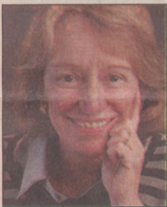
Doris Kearns Goodwin

A regular NBC news contributor, aide to President Lyndon B. Johnson, best-sell-