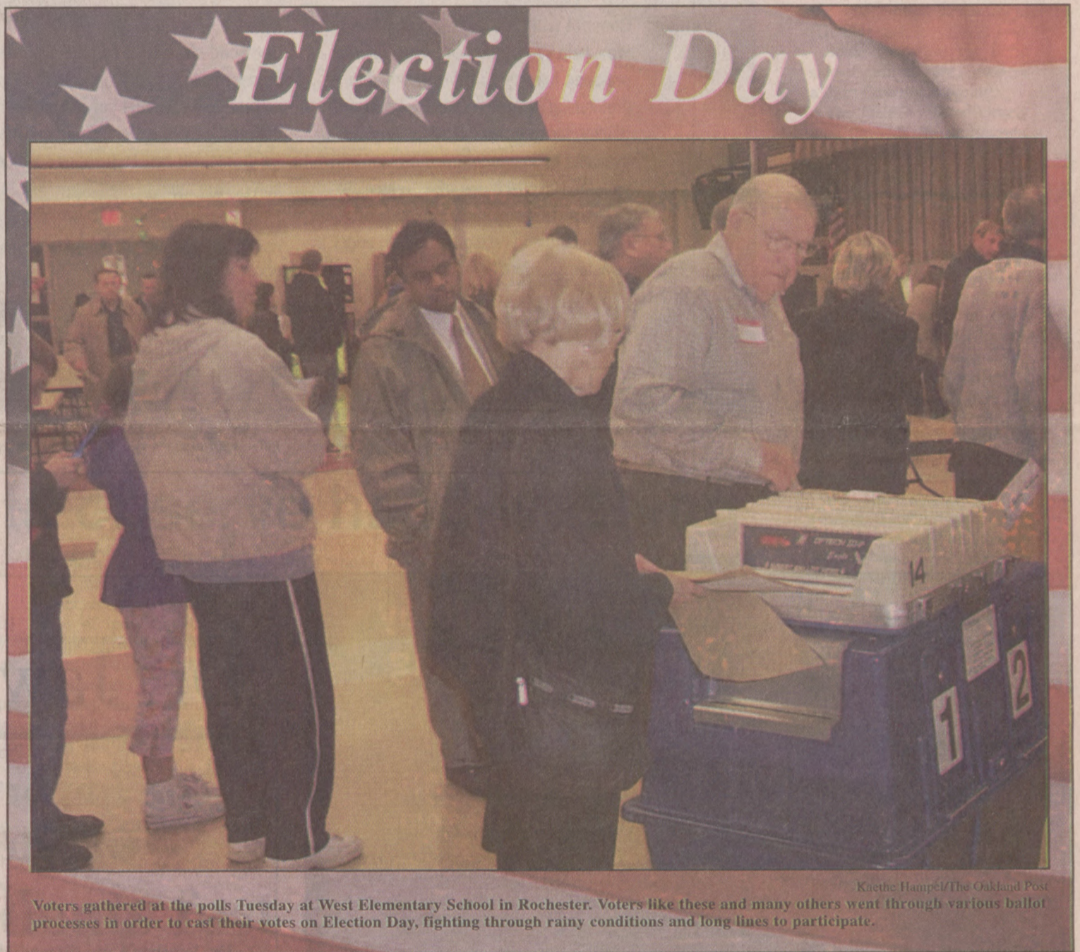
Voters gathered at the polls Tuesday at West Elementary School in Rochester. Voters like these and many others went through various ballot processes in order to cast their votes on Election Day, fighting through rainy conditions and long lines to participate.