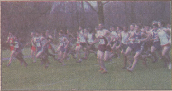
The men's and women's cross country squads had the advantage, competing on campus this weekend. —B5