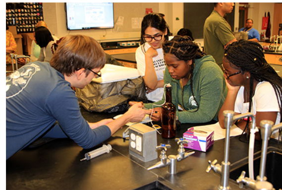
PUB students in the lab.

“This is a classic medical diagnostic procedure that has been used for decades to diagnose risk of developing hypertension in the future,” he said. “What we’re using it as is a way to measure human metabolic responses to cold temperature exposure. In this case, all the student does is measure their resting heart rate, stick their hand in ice water, and measure the change in their heart rate, as well as the change in their body temperature. They use this data to determine how their body temperature and heart