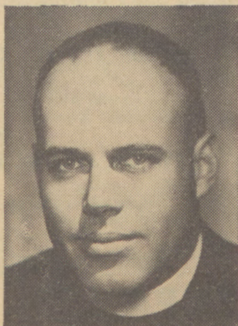
Rev. Malcom Boyd

He will speak at 1 p.m., Thursday, Nov. 8 in the Oakland Center Gold Room.