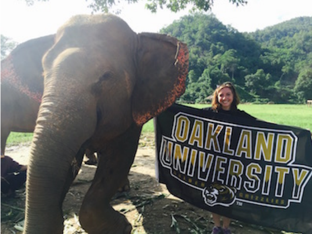
Study abroad opportunity in Thailand