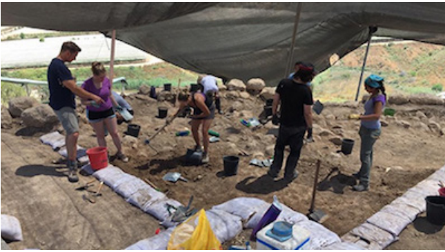
Archaeology dig summer program to Israel