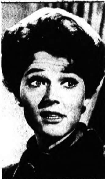
Polly Bergen plays the first woman president in "Kisses for My President," on "Friday Night at the Movies" at 9 on Channel 2.

6:00 (2) (4) (7) C — News, Weather, Sports (9) R C — I Spy — Nancy Wilson is guest star as a Las Vegas singer embroiled in the violence of international intrigue. (50) R C — Flintstones (56) What's New — "Peter and the Potter" (62) R — Sea Hunt 6:30 (2) C — News—Cronkite (4) C — News — Huntley, Brinkley (7) C — News — Reynolds, Smith (50) R — McHale's Navy (56) TV High School — "Natural Science" (62) R — Highway Patrol 7:00 (2) C — Truth or Consequences (4) (7) C — News, Weather, Sports (9) R — Movie: "Charlie Chan in Shanghai" (1935) Smuggling and gang wars engage Chan's attention in Shanghai. Warner Oland, Keye Luke (50) R — I Love Lucy (56) Republic — Discussion of air pollution and its medical effects (62) C — Swingintime —