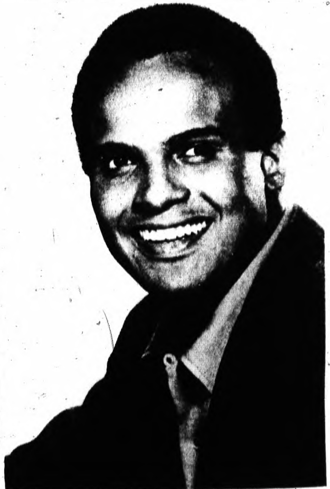
Raquel Welch and Harry Belafonte will be guests on "The Dick Cavett Show" Fri at 10 p.m. on Channel 7.