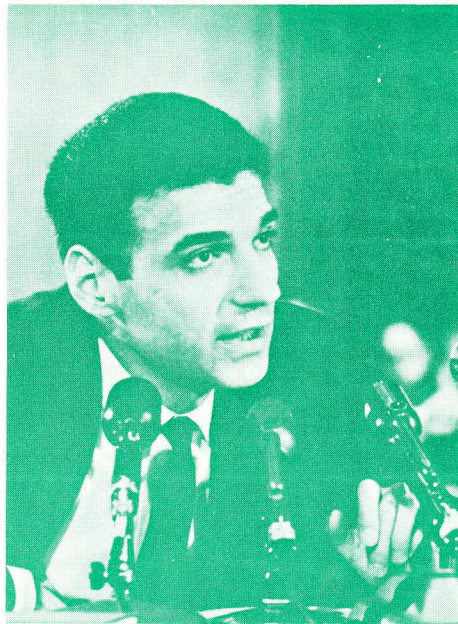
NADER SPEAKING ON ENERGY CRISIS

If you would like to run for Commuter Council, you may pick-up a petition today at the Commuter Services Office 118 O.C.