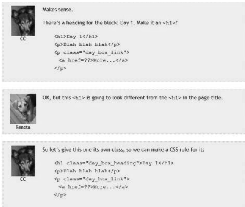
Figure 5. Pedagogical agents