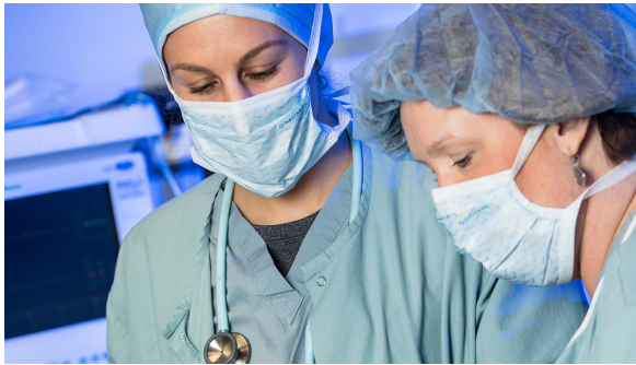
OU's Master of Science in Nursing is ranked no. 44 on Study.com's 2019 rankings of the nation's best master's programs in nursing

students, the quality of education, faculty and more. In a brief profile , Study.com highlighted Oakland's adult/gerontology nurse practitioner and family nurse practitioner tracks, along with its forensic nursing program.