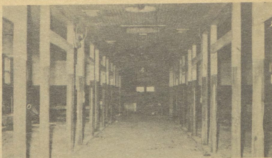
ed at the crossbar of the T-shaped building (far end), with audience seating extending to the main entrance (center). Interior view (above right) from