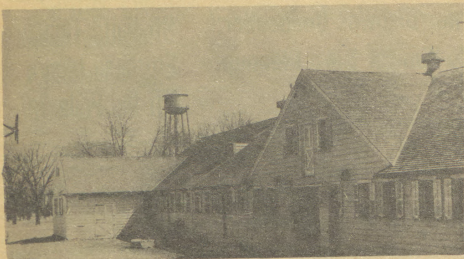
PROP STORAGE and scenery painting workshops will be located in the rear half of the Belgian Barn (above left, foreground). A stage will be construct-