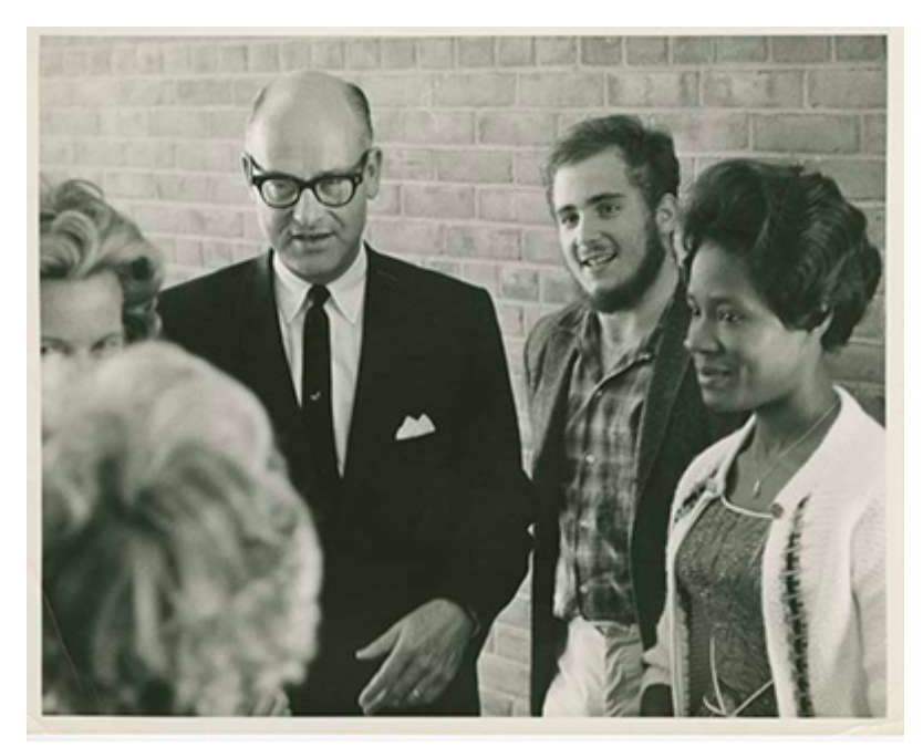
Chancellor Varner with students

Varner passed away on October 30, 1999 at age 82.