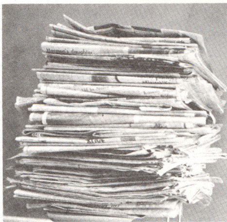
A notable exception-papers pile up in News Services to be clipped and recycled.

During the past year, the recycling paper program sponsored by the Office for Student Organizations has received, with a few notable exceptions, a lukewarm response from the members of the Oakland community. Although the number of participants in the program is not as high as hoped, the program itself has proved to be workable. The basic guidelines for recycling materials are as follows: