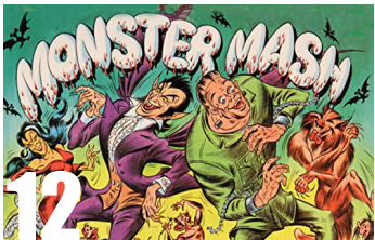
12 HE DID THE MASH The five best Halloween songs, ranked and explained.