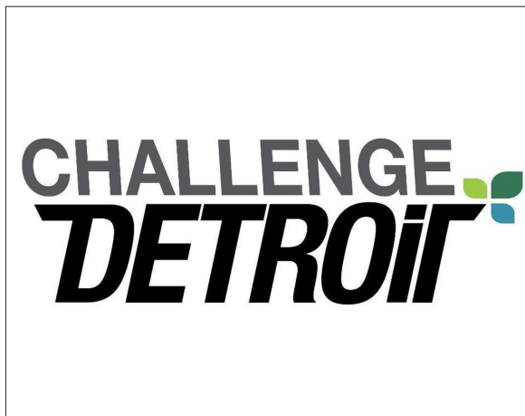
Challenge Detroit is a fellowship program which aims to share a different narrative about Detroit.

The host companies review the applicants they are interested in interviewing, based on the materials that are submitted for the application process of Challenge Detroit. Then the host company and candidate rank their choices to get a match. This ensures that a fellow is paired with a company they would like to work for.