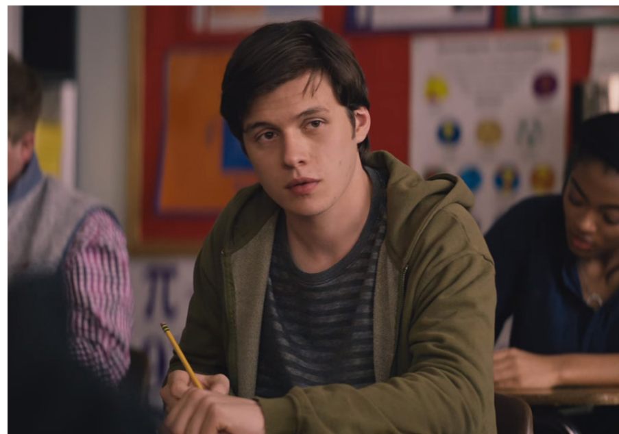
We need better LGBTQIA+ rom coms, no more "Love, Simon"s.

It's honestly incredible what can be created without including unnecessary trauma and overplayed tropes. Here's the bones, Hollywood — now make it happen. Please, I am begging.