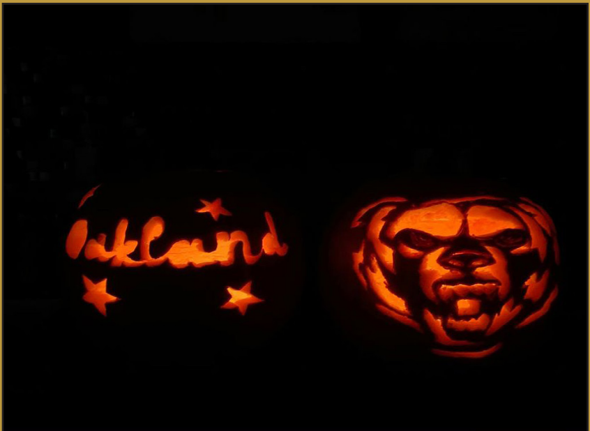
Over the course of Homecoming week and lasting until the 27th, the Alumni Association held a pumpkin decorating contest. Result will be posted on October 30th.