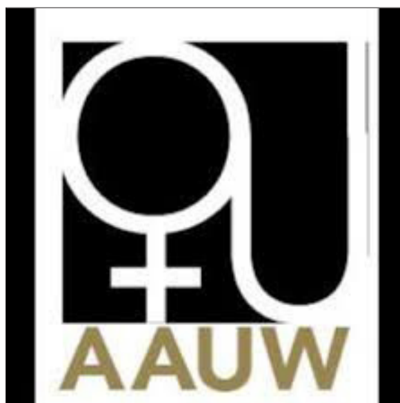
Oakland's America Association of University Women will be hosting a Breast Cancer walk on Oct. 31 to stand in solidarity with women battling breast cancer..

Throughout the walk, upbeat music will be playing along with snacks, Halloween candy, poster boards and signs. Participants are encouraged to wear any breast cancer or pink attire, along with a mask, which is mandatory.