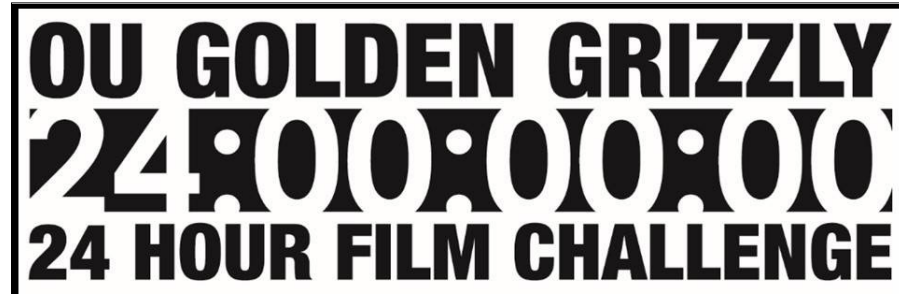
Cinema Studies and the Alumni Association hosted a virtual 24-hour film challenge.