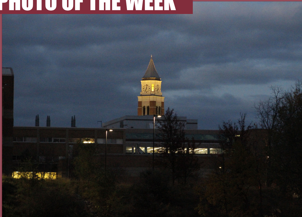
QUITE THE SPOOKY SIGHT On a crisp October night, the Elliott Clock Tower lights up a hazy night sky.