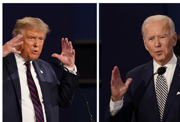
Finally, the second debate between Biden and Trump had a mute button to stop interrupting.

This would have been extremely helpful in the 2016 presidential debates.