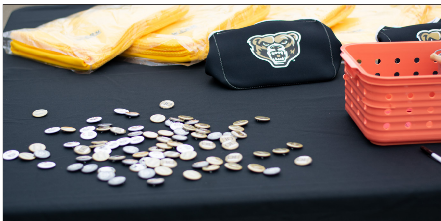
Buttons and fleece blankets were given away during the event, as well as hot chocolate and cookies.

Wilson ignited Oakland University's origin, and although she isn't a fixture of the campus anymore, her personal touches are scattered thoughtful OU: university history, events, like Matilda's Birthday Bash, buildings on campus and tours at the Meadow Brook Mansion. The annual Birthday Bash is a way to remember her contribution to Oakland University.