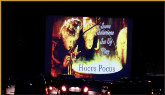
The Alumni Association partnered with the Student Board to put on a drive-in movie featuring Hocus Pocus on Saturday, October 24th.