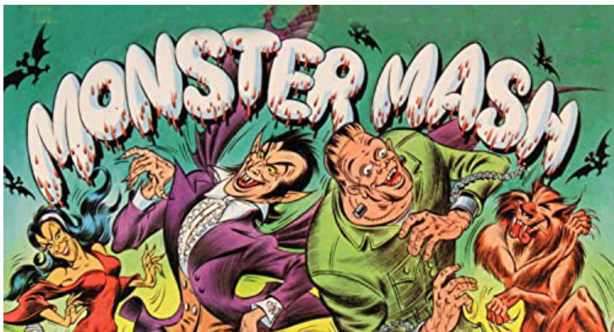
'Monster Mash' is a classic, but is it the best Halloween song?