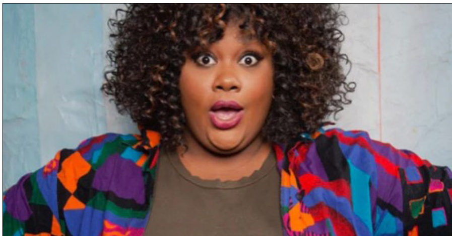
Nichole Byer at the New York Comedy Festival in 2019