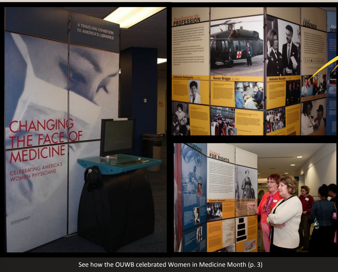
See how the OUWB celebrated Women in Medicine Month (p. 3)