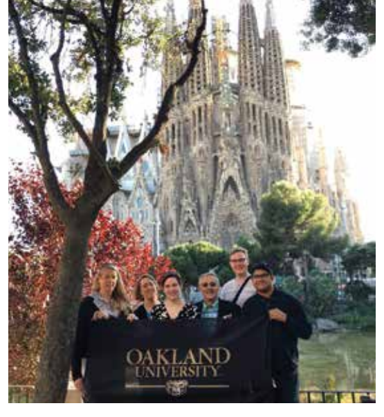
MBA students in front of Basilica La Sagrada Familia in Barcelona, Spain, in 2016.