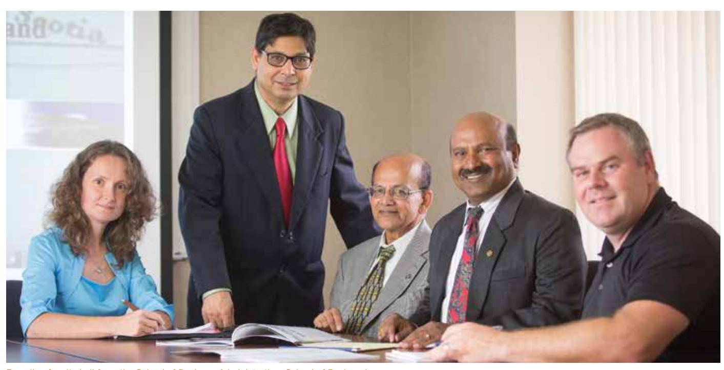
Founding faculty hail from the School of Business Administration, School of Engineering and Computer Science and the College of Arts and Sciences.

Learn more about the Data Science and Analytics Center at oakland.edu/research/centers/ datascience.