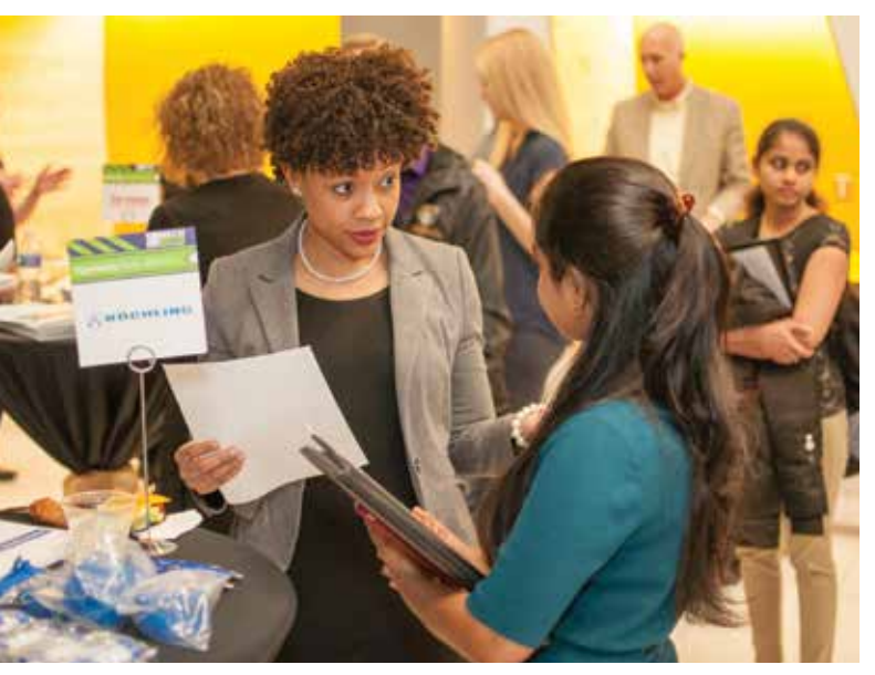
A dozen companies with strong ties to the auto industry participated in the career fair at the MICHauto event.