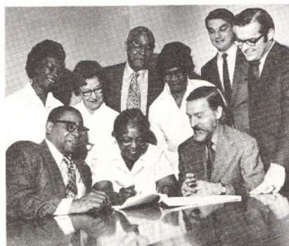
LOCAL 1418, COUNCIL 7, REPRESENTATIVES OF THE AMERICAN FEDERATION OF STATE, COUNTY AND MUNICIPAL EMPLOYEES' UNION SIGN THEIR FIFTH CONTRACT