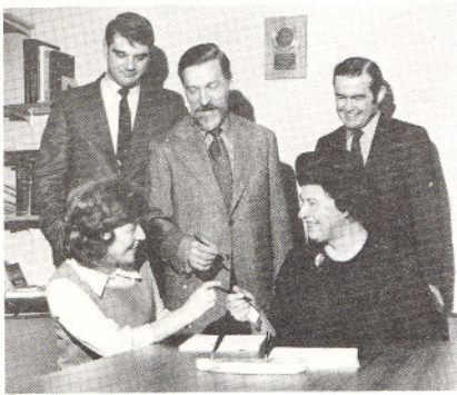
CLERICAL TECHNICAL ASSOCIATION OF OAKLAND UNIVERSITY REPRESENTATIVES SIGN THEIR FIRST CONTRACT