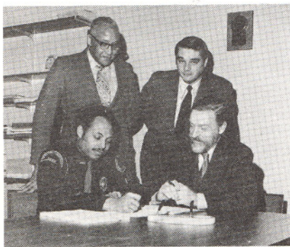
REPRESENTATIVE OF OAKLAND UNIVERSITY POLICE OFFICERS' ASSOCIATION SIGNS FOR FIRST CONTRACT