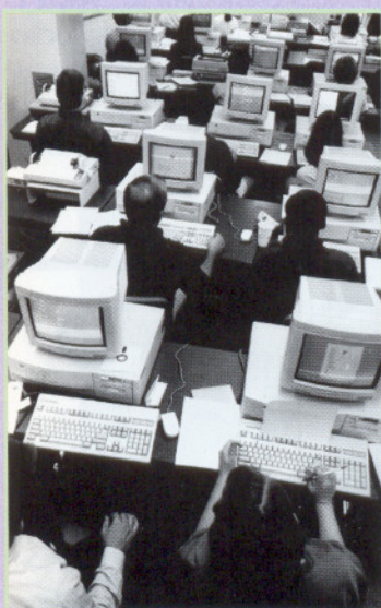
OU is dedicated to preparing students for the challenges of the 21st-century workplace and society.

Health and earned $2.2 million in external funds during 1996/97.