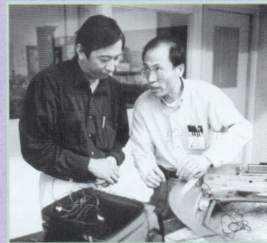
Faculty internships at Chrysler Corporation are making Oakland known as the learning center for the automotive industry.

For more information about classes and degree programs, call the Office of Admissions at (248) 370-3360. For events information, call the Center for Student Activities and Leadership Development at (248) 370-2020. Visit Oakland's homepage at http://www.oakland.edu .