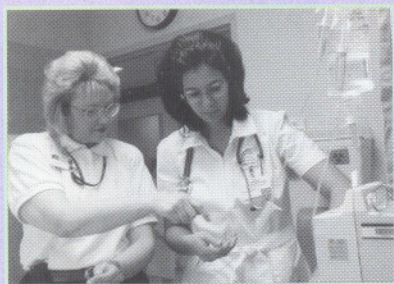
OU student nurses receive on-site training at Henry Ford Health System as part of the unique partnership formed by the institutions.

the undergraduate level. Quality of academics continues to be recognized — OU was rated 24th in academic reputation among the 123 top Midwestern regional colleges and universities for 1998 by U.S. News and World Report . For the second consecutive year, Oakland has been listed in America's 100 Best College Buys 1997-1998 , by John Culler & Sons.