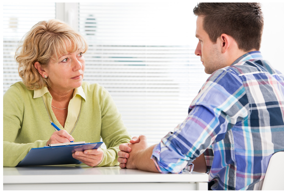
Oakland's social work program was named second-best in the state by the career website Zippia.com