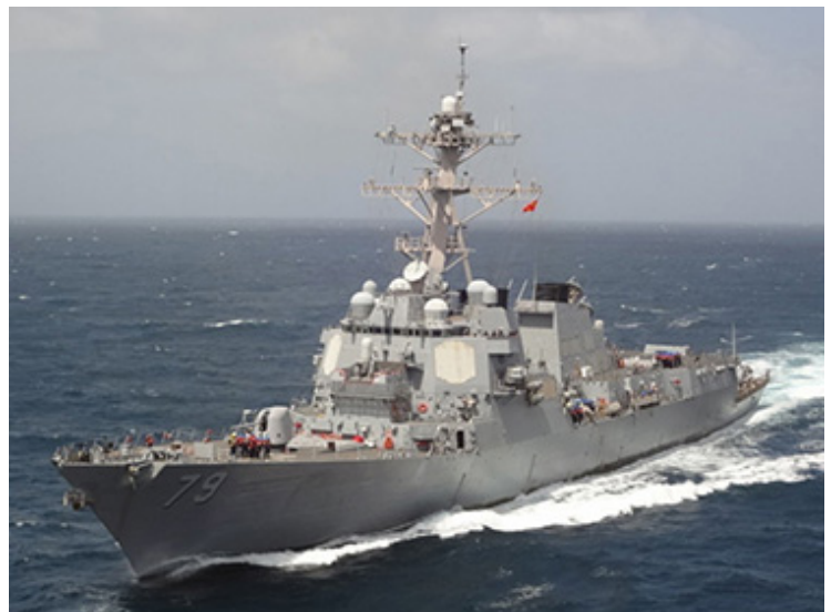
USS Oscar Austin