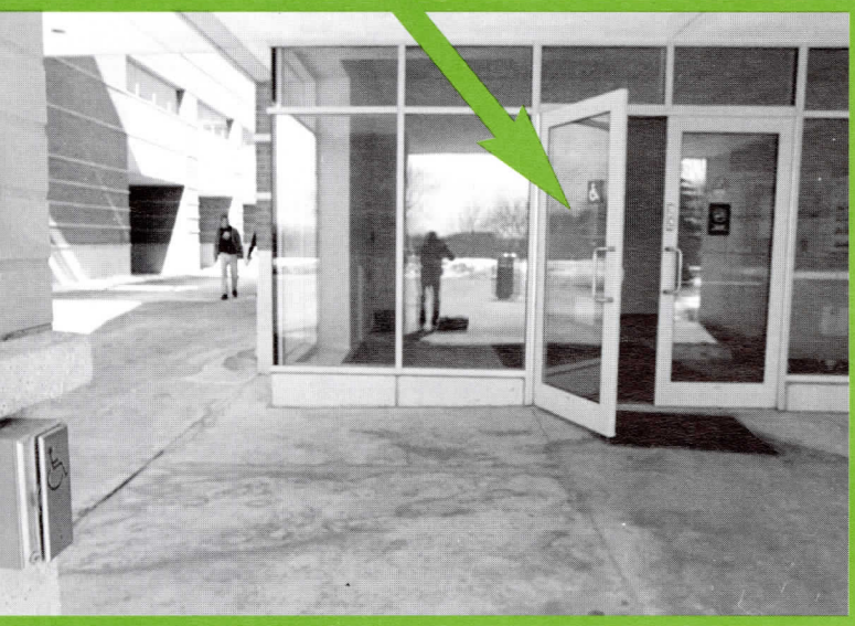
Automatic door openers allow better access to Oakland University buildings.