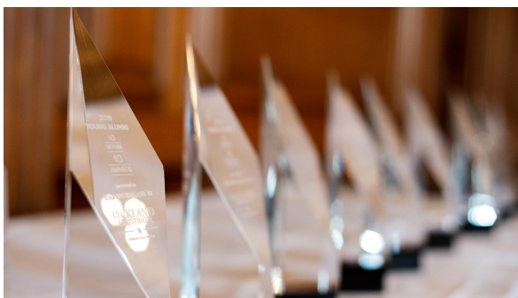
Oakland University's Office of Alumni Engagement welcomed its newest class of 10 Within 10 Alumni Award recipients with a ceremony in May.