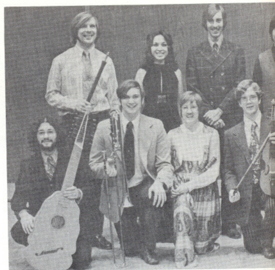
"Love, Medieval Style"--The OU Renaissance Ensemble, (back row, left), presents its Wednesday at 8 p.m. in Varner Recital Hall.

Visitors will receive four hours of parking for 25 cents, or 96 minutes for a dime or 48 minutes for five cents. The lot was formerly reserved for students, and additional student parking has been created in lot A near Varner Hall to make up for the loss of space in the metered lot.