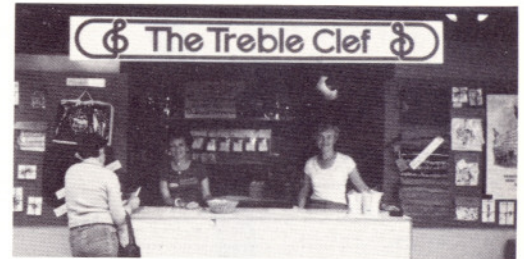
The Treble Clef Gift Shop on Trumbull Terrace.