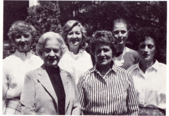
1982 Executive Committee members left to right First Row: