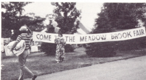
Second Annual Meadow Brook Fair — July 31 — Aug. 1 Grounds open at 5:00 p.m.