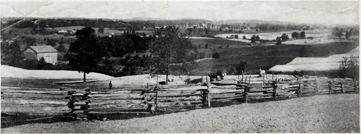
View from Overlook Farm

High land—altitude 850 feet; 130 acres, highly restricted; low taxes; more than 100 feet above the lovely Clinton Valley. On Flint Electric and State Road, one mile south of beautiful Rochester; one mile from Michigan Central and Grand Trunk railroad stations; running four ways. Nearly one-half mile square of beautiful, rich, rolling land. Electric light, heat and power, and telephone along side; mail, and store delivery. A short walk, or 5-cent fare, to town. Ten-acre park, in center. Large, tall, thrifty trees.