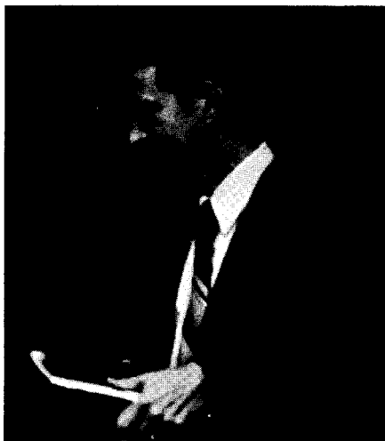
A photo album