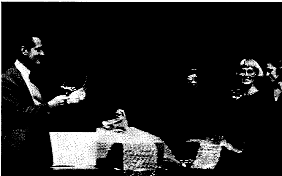
A gift of Steuben Glass from the President's Club