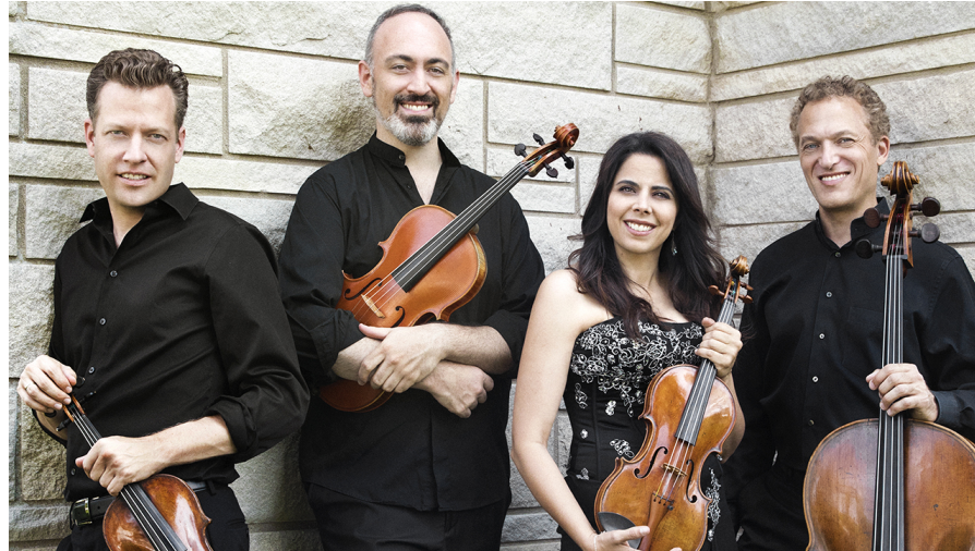
The Chamber Music Society of Detroit's sixth annual series at Oakland University's Varner Recital Hall opens at 3 p.m. on Sunday Sept. 30 with the Grammy Award-winning Pacifica Quartet.