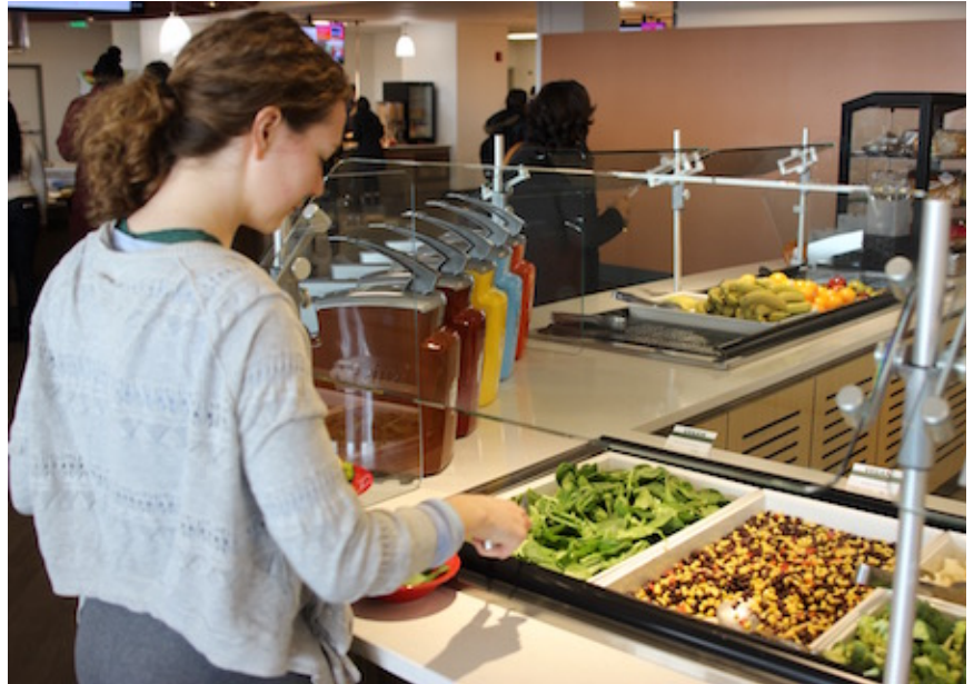
This student checks out some of the many vegan offerings at the Vandenberg Ha dining hall.

In a message to Oakland students on Facebook after the learning the news, Chartwells posted: "We are so incredibly honored to announce that we've been awarded an "A" report card from peta2 for our Vegan options on campus! This would not be possible without the help of wonderful students and staff, supporting us and providing us with their feedback about our menus and their diets. We cannot thank you a enough for helping to push us to be the best we can possibly be! We look forward to continued growth, both in food and our relationships all of you. Thanks again!"