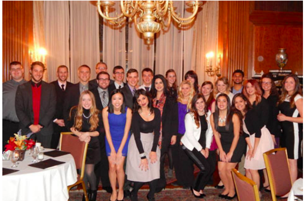
Pi Sigma Alpha Formal Induction

In 2014, Nu Omega also inducted its largest number of members – 63 – since the chapter was chartered at OU in 1983.