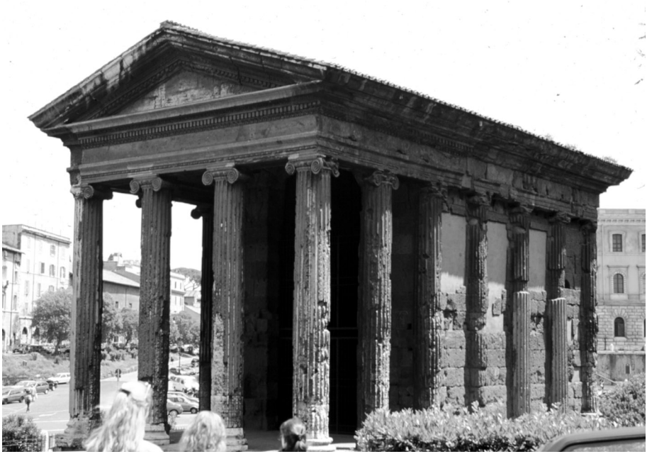
Figure 4: Temple of Fortuna Virilis