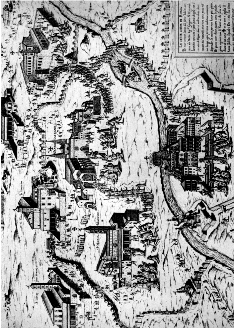
Figure 3: Seven Pilgrim Churches