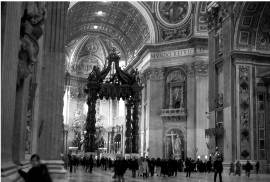
Figure 5: St. Peter's Church, Interior