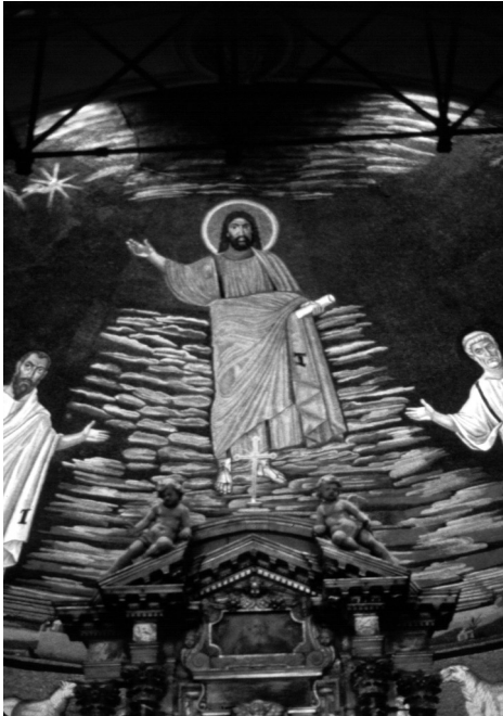
Figure 7: S.S. Cosmas & Damien