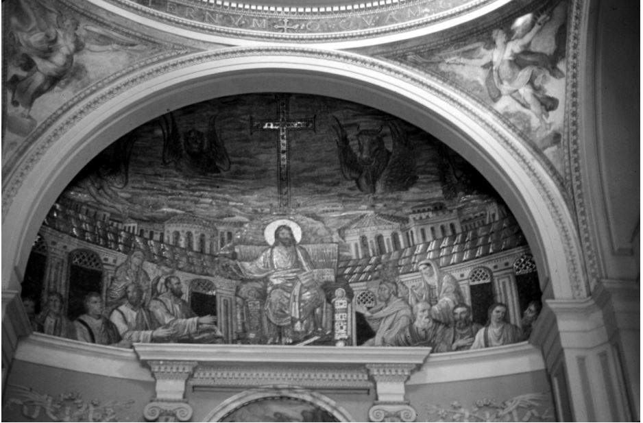
Figure 6: S. Pudenziana