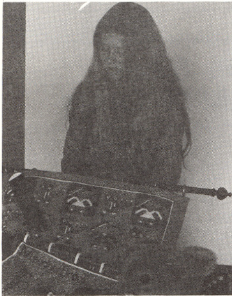
FIRST PRIZE WINNER