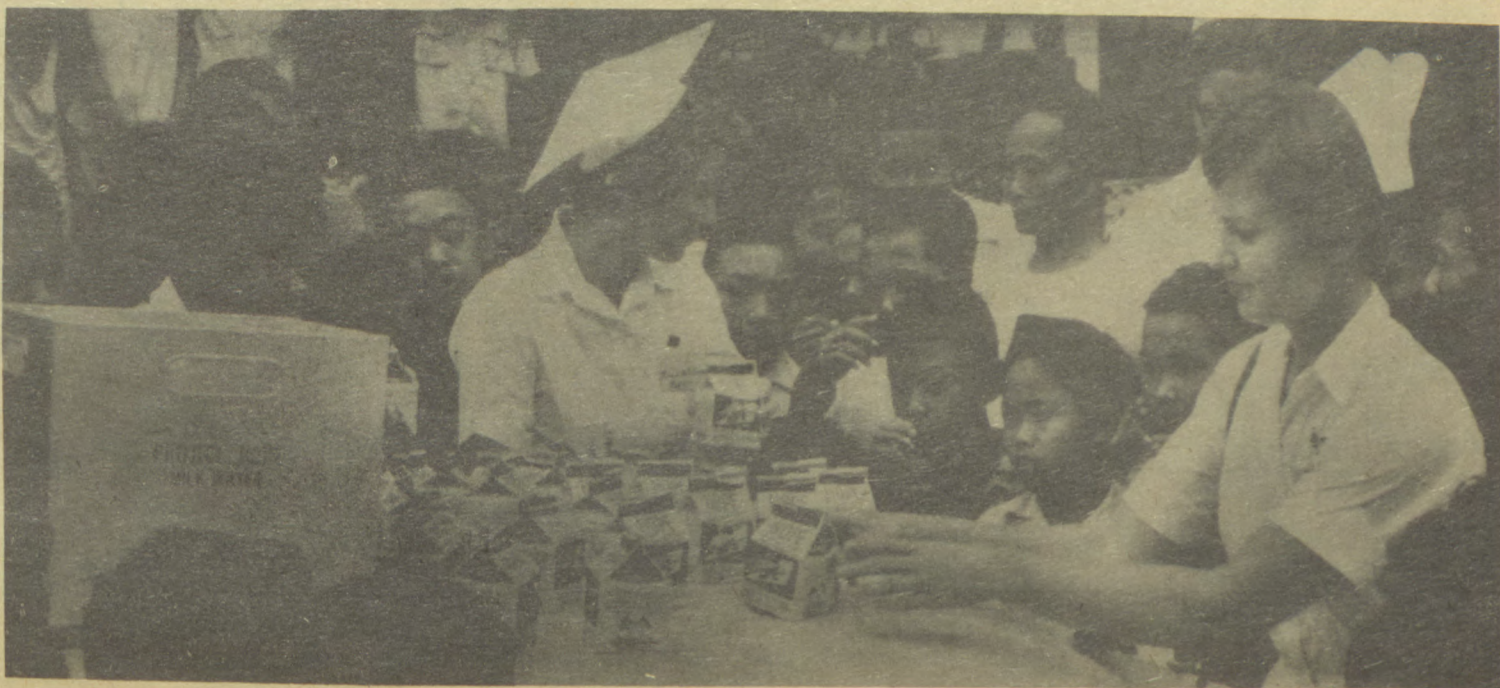
Nurses from the SS HOPE I distribute the ship's manufactured

milk to Indonesian children, many of whom said they had never tasted it before.