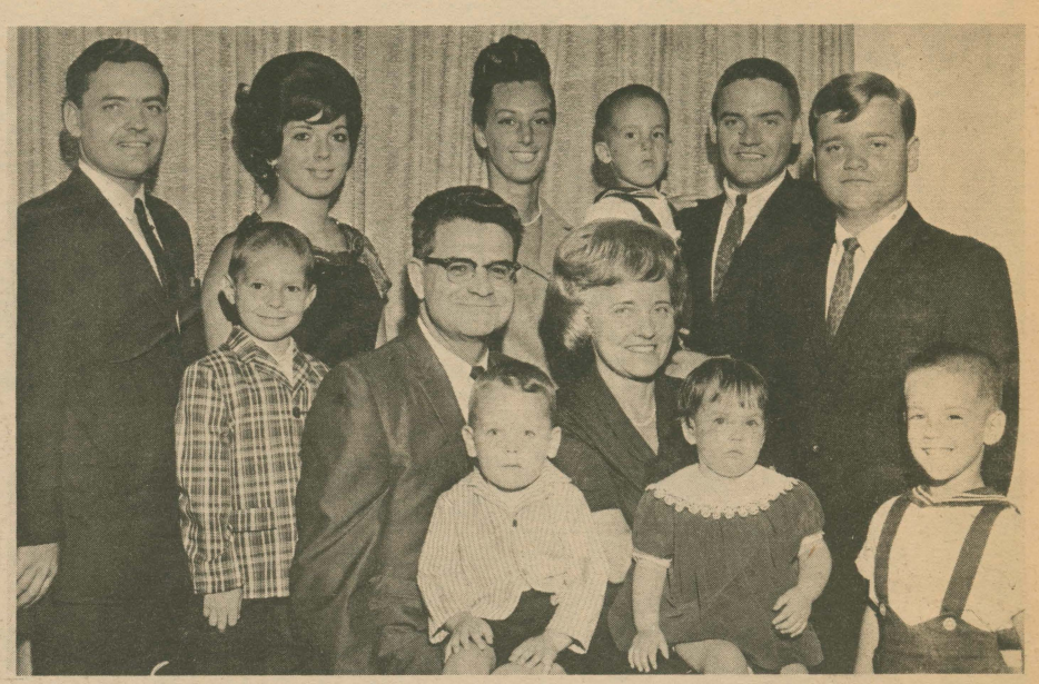
The Farnum family: sons, daughters-in-law, grandchildren