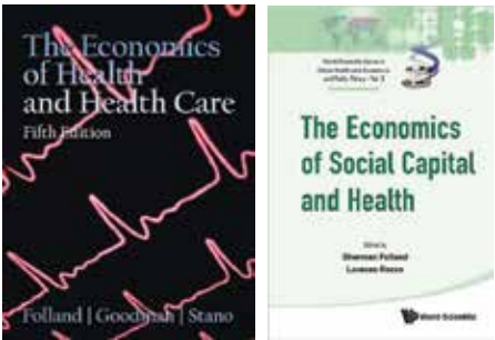
Oakland business students also appreciate his influence.