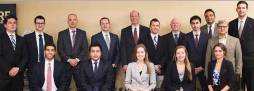
Oakland’s first student managed investment team with the members of the advisory board.

“These students have an opportunity to get a much deeper multifaceted understanding of how some very complex