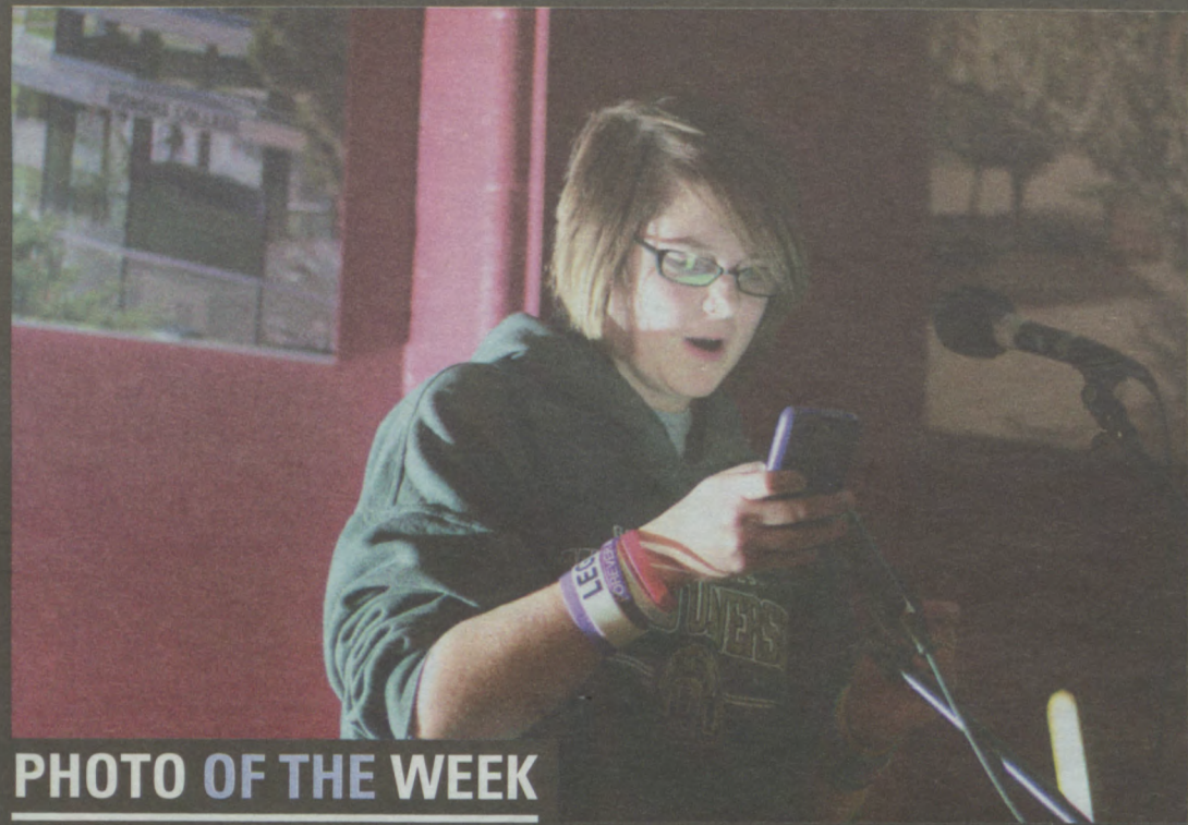
PHOTO OF THE WEEK