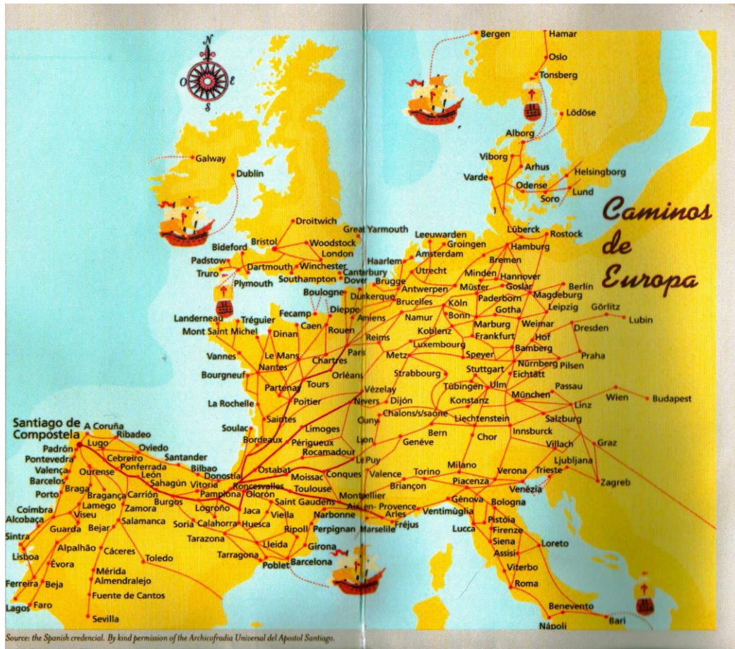
Figure 1 Map of all Camino de Santiago routes throughout Europe from the pilgrim’s credential