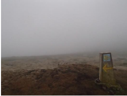
Figure 7 Signs in the form of yellow arrows and or seashells point the direction of El Camino de Santiago. On El Camino Primitivo they are sometimes hard to find because there is often much time between the signs.