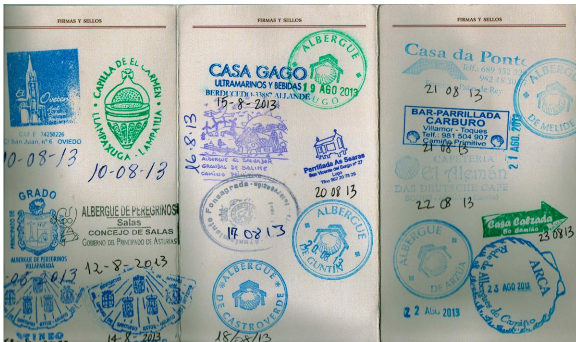
Figure 4 The stamps on my pilgrim's credential. In each albergue a pilgrim stays at he or she gets his credential stamped. In order to received a Compostelana , a pilgrim must get at least two stamps everyday for the last 100km. Stamps can be found in cafés, bars, and albergues .