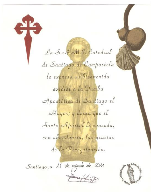
Figure 6 This is an example of the “cultural” Compostelana .