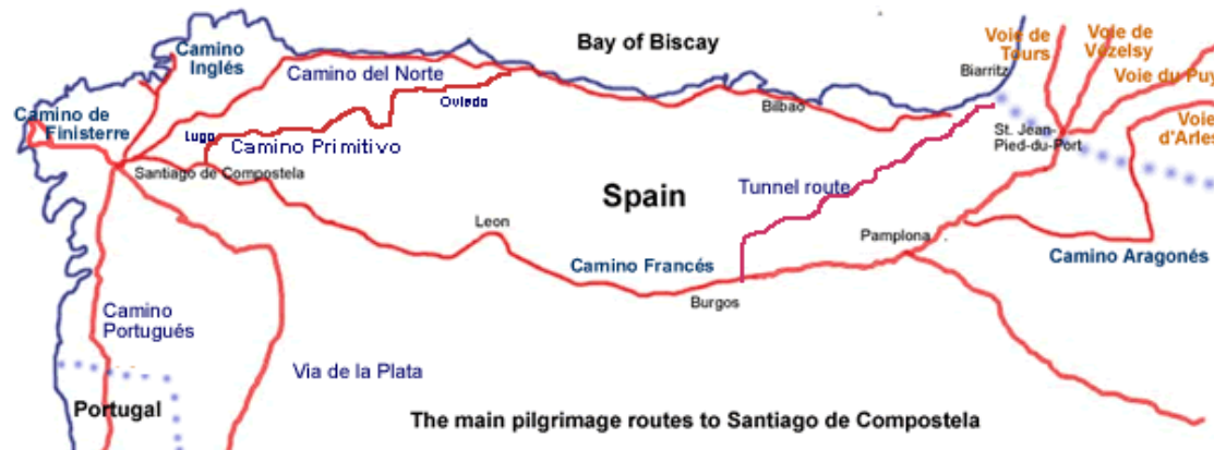
Figure 2 Map of the main pilgrimage routes in Spain. Important to note Camino Frances and Camino Primitivo.