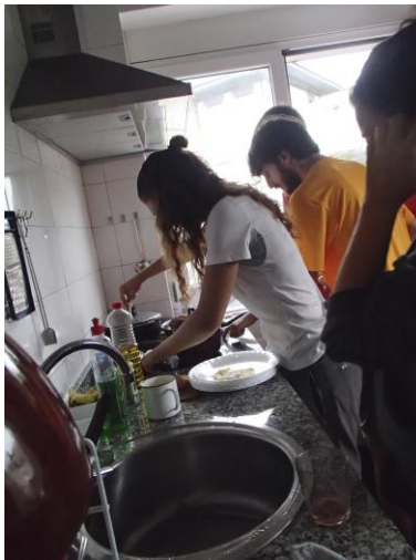
Figure 9 Pilgrims who did not know each other the day before gather to make dinner.