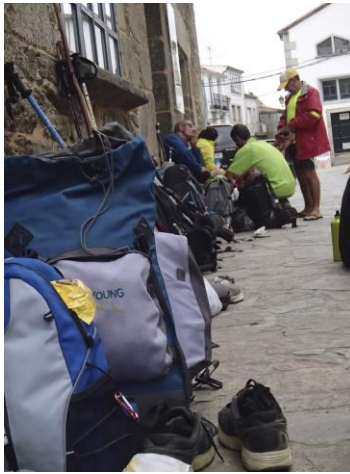
Figure 8 Pilgrims line up with their bags waiting to enter in the albergue in Melide.