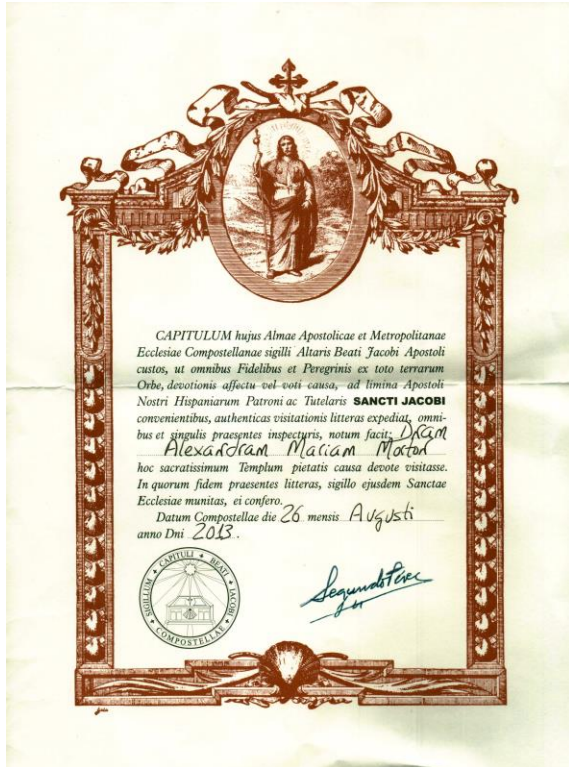
Figure 5 The Compostelana I received upon completion of the Camino. This acts as an example of the “religious and cultural” Compostelana , which is written in the cursive type, in Latin, and surround by a fancy border.